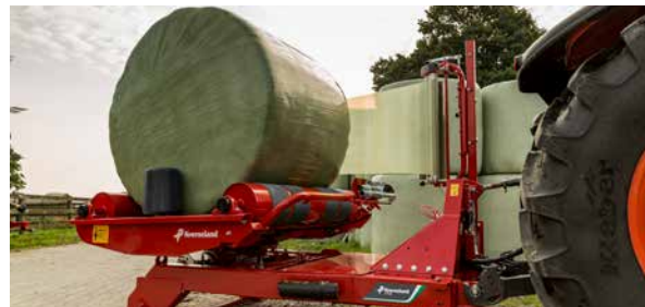
Able to handle round balers up to 1200 kg.